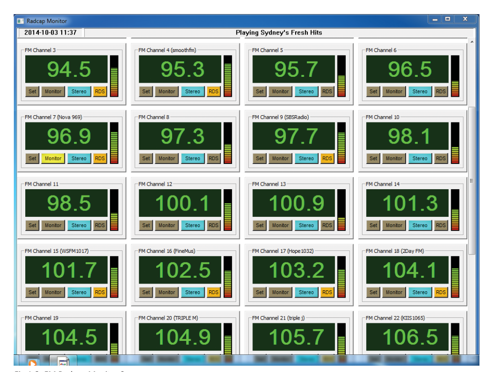
Fig 1-3: FM Radcap Monitor Screen

Windows 7 and 8 provide similar functionality with their Listen option under the Recording device properties, allowing each station to be monitored on a designated audio output device.