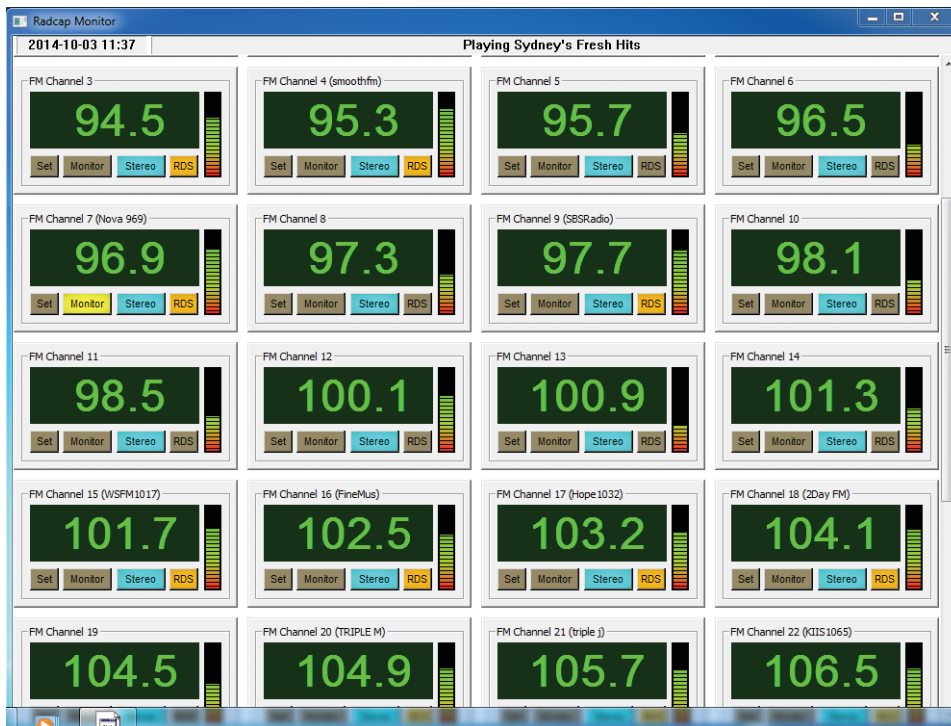
Fig 1-3: FM Radcap Monitor Screen

Windows 7 and 8 provide similar functionality with their Listen option under the Recording device properties, allowing each station to be monitored on a designated audio output device.