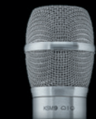
KSM9, KSM9HS (in Black or Nickel)

Also available with these Shure microphone cartridges