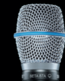
BETA® 87A, BETA® 87C