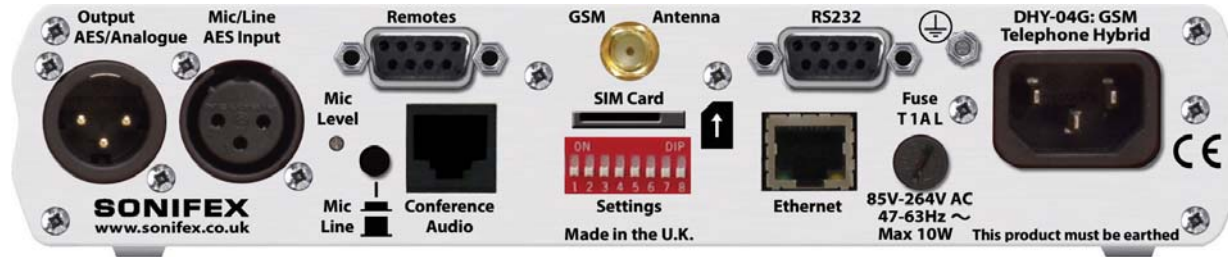
The DHY-04G Rear Panel.