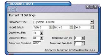
SCI Disconnect Method Settings Page.