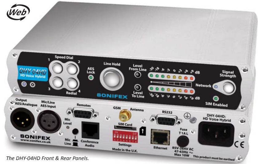
The DHY-04HD Front & Rear Panels.

The DHY-04HD HD Voice Hybrid is used on a 3G or GSM cellular (mobile) phone network instead of a telephone (POTS) line. The DHY-04HD can accept a SIM card in the rear panel slot and by connecting a suitable GSM antenna, it can receive and make high quality broadcast calls over the cellular network, converting the 3G or GSM call to the 4 wire audio signal to and from a connected mixing console. The module used in the DHY-04HD is quad-band GSM and 5 band UMTS/HSPA+, so it can take and make calls on any 2G GSM, or 3G network.