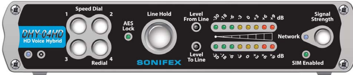
The DHY-04HD Front Panel.