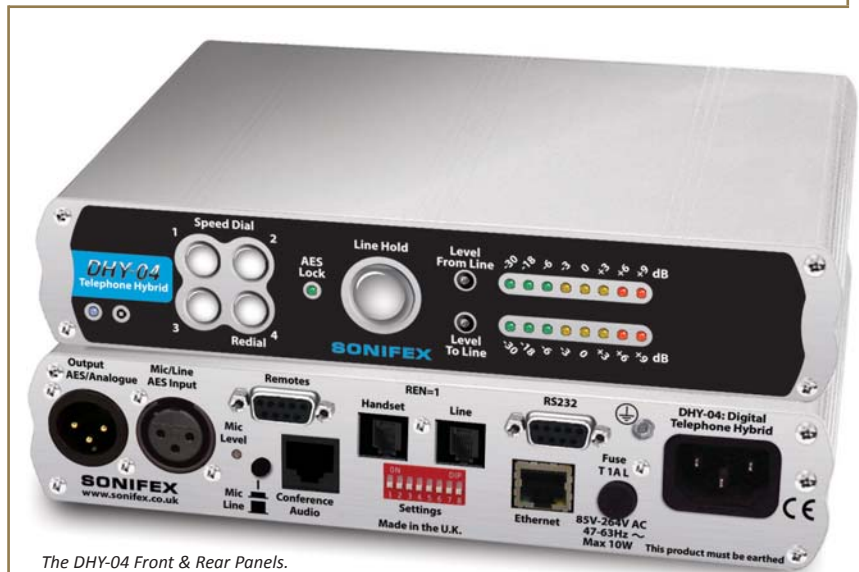
The DHY-04 Front & Rear Panels.