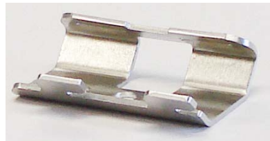
LD-IT LED Sign End Mounting Installation Tool.

The display mode and colour options are set-up using a separate remote control, the LD-RPC.